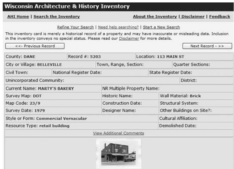
Example of a record from the Wisconsin Architecture & History Inventory

Several years ago, The Society developed this online version of the Architecture and History Inventory that made the written information in the records more widely available to the public.